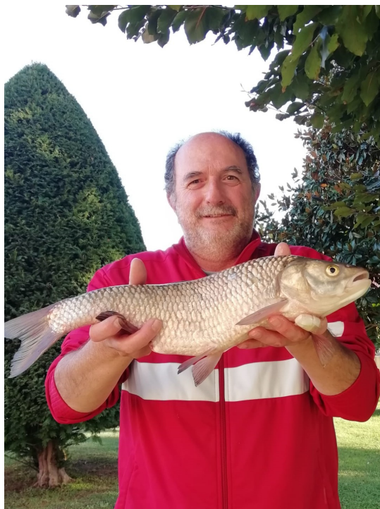
Figure 3: Happy fisherman