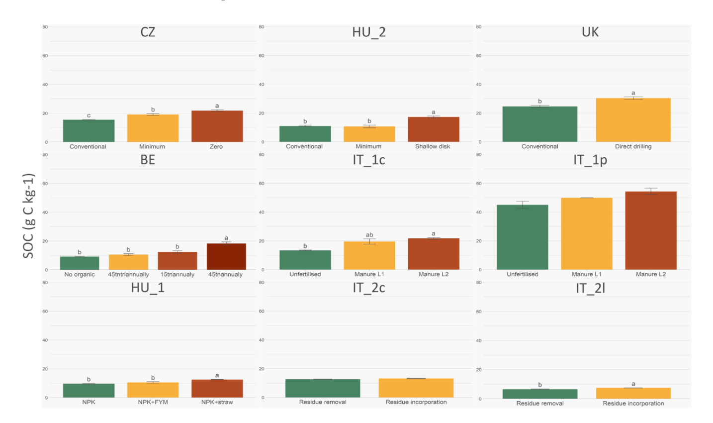
Figure 1. SOC content in the topsoil (0–15 cm) for each study site (see also Table 1 for the codes and Table 2 for a description of the soil improving treatments). Error bars represent the standard error (n -number of treatments replications- is denoted in Table 3 for each experiment).

tillage presents lower CO<sub>2</sub> emissions [64] or higher levels of mineralizable carbon [65] when compared to conventional ploughing, indicating reduced mineralization because of minimal disruption of the stable aggregates. A more stable soil structure and improved aggregation also lead to reduced losses of fertile carbon-rich topsoil because of reduced water erosion. Nevertheless, it should always be kept in mind that only the topsoil 0–15 cm was sampled. Carbon stock changes may be observed in the no- or reduced-tillage experiments within the top layer sampled but if the whole soil profile is considered, conclusions cannot be drawn from our analysis. There is recent evidence to show that when the time since the adoption of the no-tillage system is considered (i.e., at least 6 years application of no-till), the increase of the carbon content in the top layers (0–20 cm) and the no change of the SOC in the deeper layers of the soil profile lead to an overall increase in the carbon stocks under no-tillage [41]. On the other hand, there is also evidence that when the entire soil profile is analysed, soil cultivation methods do not affect the SOC quantity but rather redistribute it in the profile [31,61,66–68].