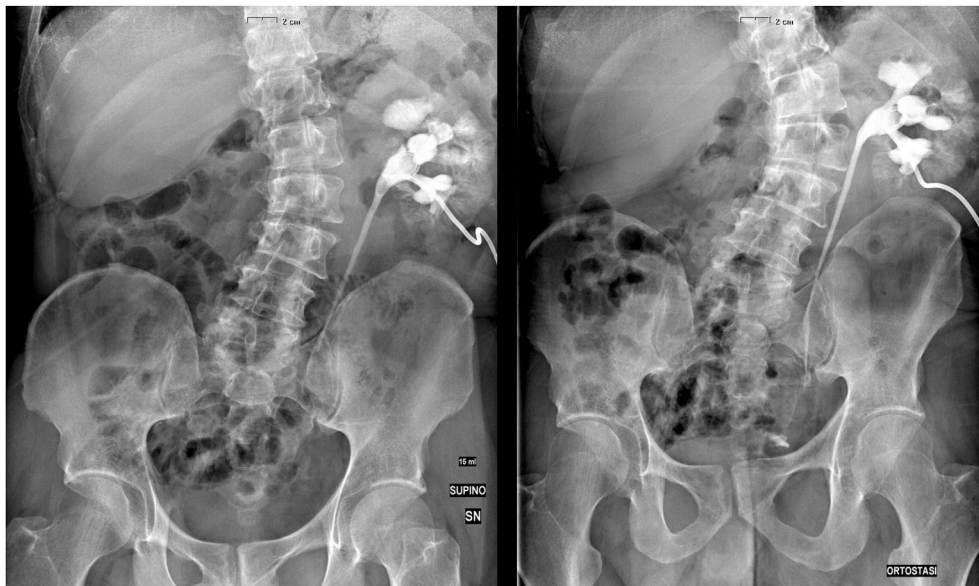
Fig. 1. Pre-operative descending nephrostography with minimal flow of contrast below the lower lumbar ureter and pyelocanalicular reflux caused by a higher-pressure injection.