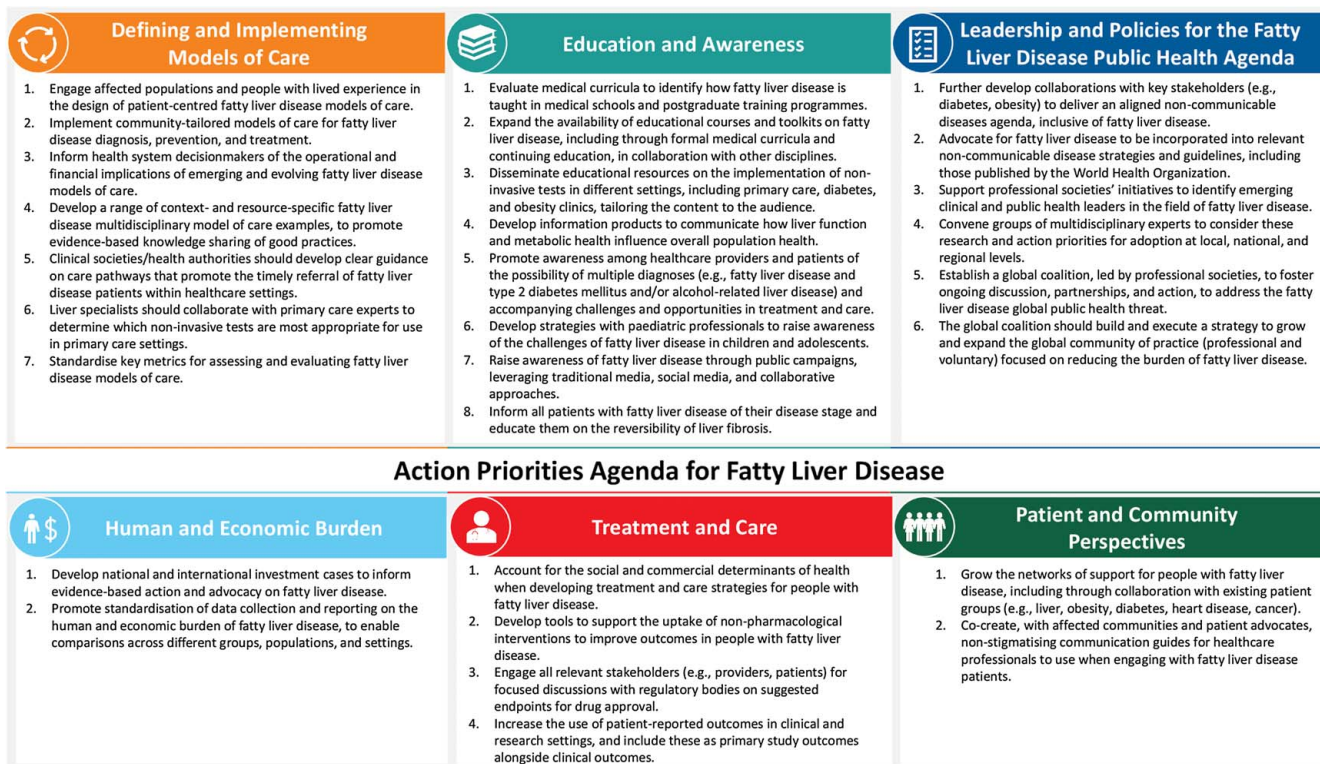
FIGURE 2 Action priorities to turn the tide on fatty liver disease.

the importance of action but the health and economic benefits of this.