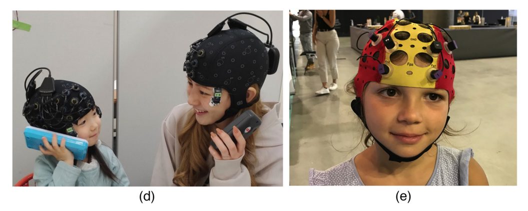
Fig. 2 Families taking part in studies using wearable fNIRS systems: (a) at a research lab visit (LUMO, Gowerlabs) and (b) during a home visit as part of the longitudinal PIPKIN Study,<sup>36</sup> (c) in a lab study on language development (NIRSport 2, NIRx), while (d) hyperscanning mother and child (Brite MKII, Artinis) combined with a wireless EMG system (pico EMG, Cometa; at the outer corner of the eyes) to measure facial muscle activity, and (e) while freely locomoting inside a building (PHOTON, Cortivision).