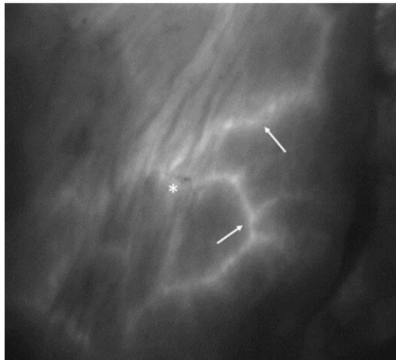
Figure 1. ICG angiography following mastectomy. The asterisk indicates the location of the nipple, and the white arrows highlight the small terminal branches of subcutaneous capillary vessels, exhibiting contrast enhancement and adequate perfusion.