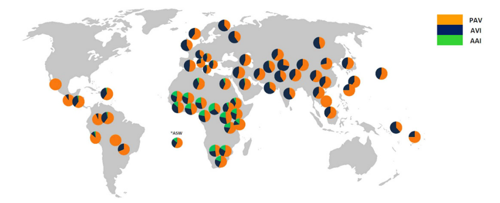
Figure 1. Worldwide distribution of TAS2R38 PAV, AVI and AAI haplotypes in the studied populations. This map has been modified from its original version (https://commons.wikimedia.org/wiki/File:BlankMap-World-noborders.png).