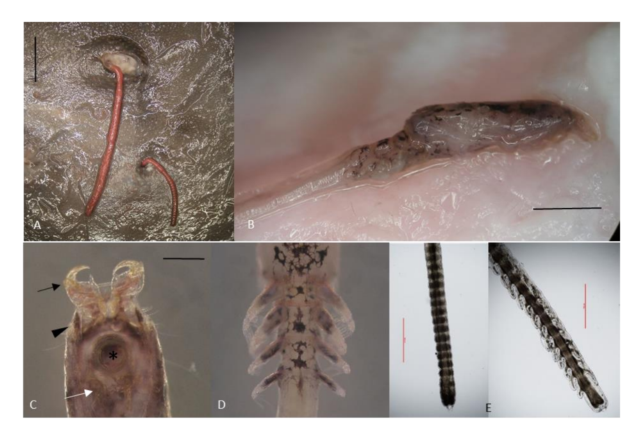
Fig.1: Immature stages of Pennella sp. (A). Abdominal portion of the parasite protruding from the host's skin (bar=0.5 cm); (B) Lateral view of cephalothorax after removing the surrounding tissues (bar=0.5 cm); (C) Ventral view of the head with first (black arrow) and second (black arrowhead) antennae, rostrum (*) and maxillipeds (white arrow) (bar=300 \mu m); (D) Cephalothorax, details of the limbs (ventral view)(bar=500 \mu m); (E) Abdomen of the parasite at two different developmental stages of the appendages.