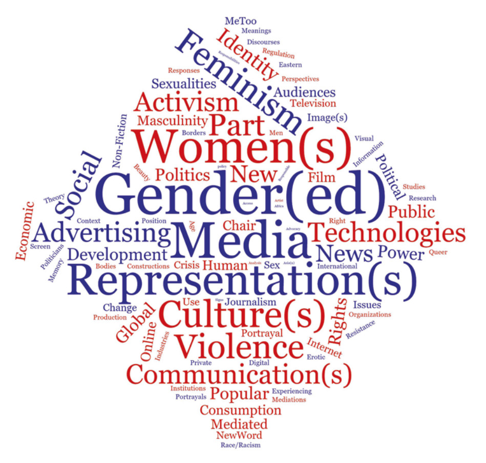
Fig. 7.1 100 Most Common Words in Gender and Communication Section Conference Session Titles, 1992–2019. (Prepared by Louise Luxton, 2022)