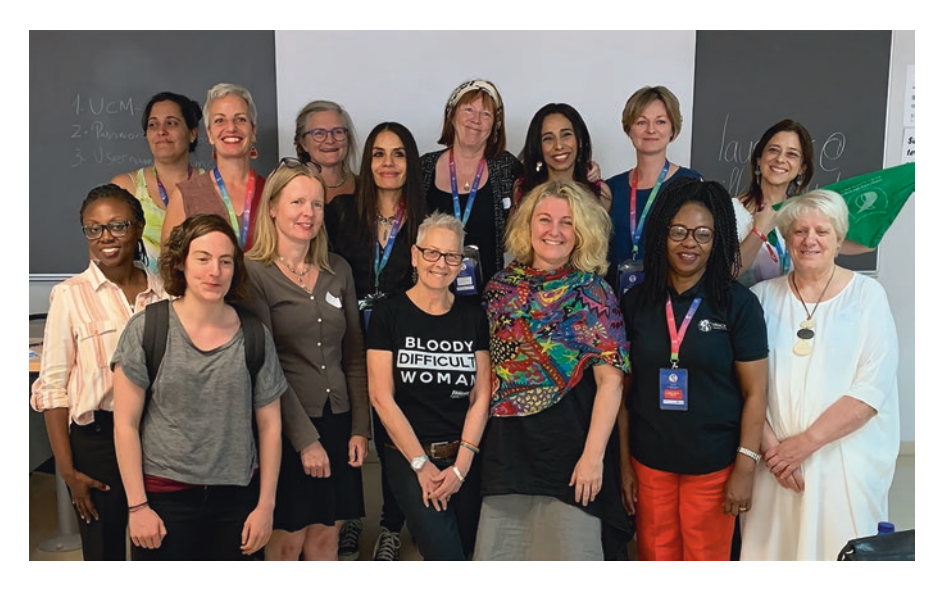
Fig. 7.5 Presentation of the "Comparing Gender and Media Equality Across the Globe" (GEM) Project, IAMCR Conference, Madrid, July 2019. Participants in the GEM Project.

"Actualizing Section J through Transnational Collaborations: making gender equality in the media and ICT visible in the 2030 Agenda" (See Fig. 7.6).