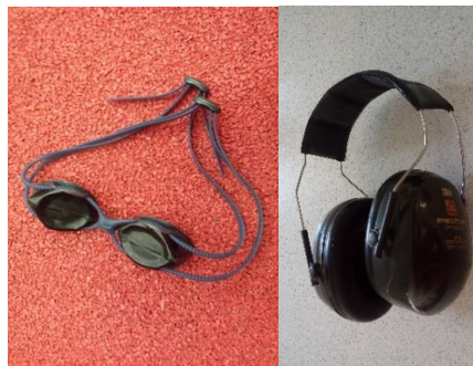
Figure 2. Dimmed glasses and ear muff.

The PedarX system collected results separately for the left and right foot regarding ground reaction force (GRF). The scanning rate was 50 Hz, with a time per frame of 0.02 seconds. GRF results for the left and right foot were recorded every 0.02 seconds. The absolute difference in force load between the legs was calculated every 0.02 seconds, as well as the average difference throughout the entire measurement. The calculation was performed by subtracting the GRF on the right leg from the GRF on the left leg. Perfect balance was indicated when the forces on both legs were equal. The variables included the difference between left GRF and right GRF while still-standing position after jumping (Diff. Jump Standing), the difference between left GRF and right GRF while in a blind still-standing position after jumping (Diff. Jump Blind Standing), and the difference between left GRF and right