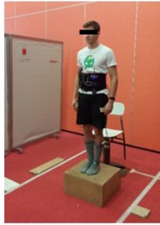
Figure 1. Subject before jump from a 25 cm high box.