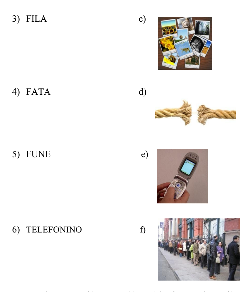
Figure 2. Word-image matching activity: for example 1) & b).