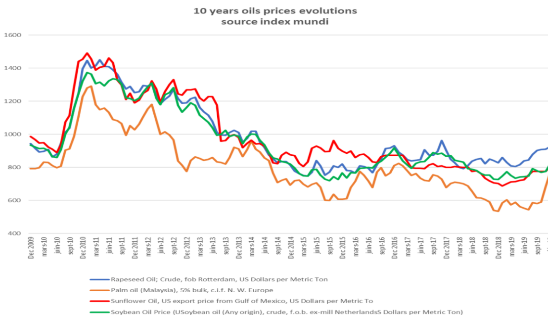
Figure 4. Evolution of vegetable oil prices (2009–2019).

the import of palm oil by Italy and three other countries of the European Union (G. Bausano, M. Masiero and D. Pettenella, personal communication).