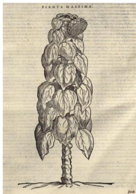
Figure 1. Drawing of a sunflower plant as reported in a letter from Cortuso to Mattioli (1585). https://archive.org/details/bub_gb_H-bmaXwpdr8C/page/n31/mode/1up . (Accessed on 5 August 2022).

In Italy, the first notice of the presence of sunflowers came from Giacomo Antonio Cortuso, who became the head of the Botanical Garden of Padua in 1590. Although he had graduated in medicine, his greatest passion was botany, as demonstrated by the numerous new plant species he discovered and classified. Cortuso cultivated sunflowers that he carefully studied to characterize the main plant traits including achene quality. A mention of his observations was reported in his famous letter addressed to the botanist Andrea Mattioli, who published it in a book in 1585. In that book, the sunflower was addressed with many names, including Maximum Plant, Royal Crown, Jupiter's Cup, Indian Sun, and Plinian Bellide, ideally referring to the height of the plant, the shape of the inflorescence, or its origin, and similarity to the Common Daisy ( Bellis perennis ) (Figure 1). Other curious names were Trumpet of Love and Rose of Hierico.