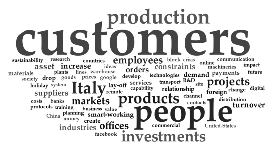
Fig. 1 Key words mentioned by interviewed firms

"We delivered a bar of chocolate with the shape of a nib to all our customers, so it was made as a nib to offer them a start, a little sweeter and a little less bitter than all problems that surely everyone will encounter in the reopening, in the reorganization, of their store, etc. There is the thought of continuing to say and tell that you are there, that you are close and talk to your customers in a different way, and I think this will be a new way to express proximity, the proximity of our brand, the proximity of the product, the proximity of the people, ok technology but also humanity".