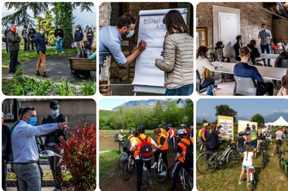
Figure 2. Pictures of some of the dissemination activities organized by the BEWARE project.

One of the most important actions identified in the Adaptation Action Plan concern the modification of the local building codes through the identification of new rules that aim to reduce the soil sealing impact and to promote a widespread adoption of NBS. This action was foresaw by the project, but it has been concretely developed during the preliminary encounters with technicians and administrators. In addition, it was presented during the participatory process where it was supported and improved by the contribution of the involved people, mainly by public administrators. Other important actions act at the social level, where the lack of awareness, the difficulty in involving people and organizations, and the absence of collaboration could be important limiting factors in the Plan implementation. These actions were developed based on the concept of strategic management of niches, a procedure focused on the management of innovations to achieve a change in socio-technical systems, revealed crucial for learning about social challenges and stimulating transitions (Caniels and Romijn, 2008; Raven et al., 2010).