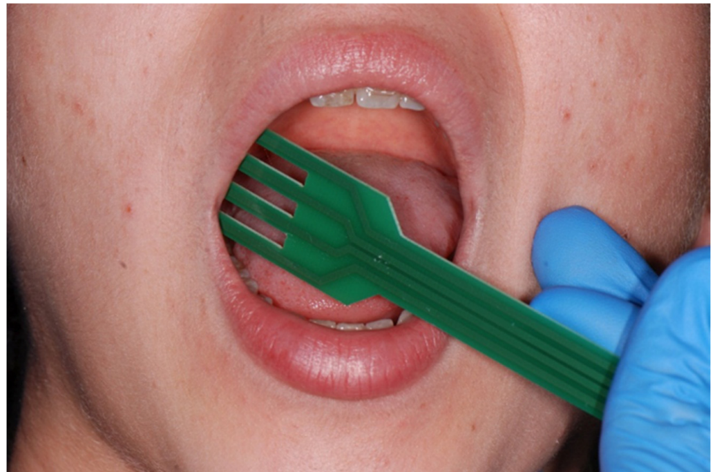
Figure 1. The use of the "fork".

The aim of the present experimental study was to ascertain any differences in the bioelectrical impedance of tissues in OLP patients as compared with healthy controls.