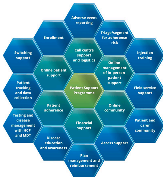
Fig. 2. PSP activities and resources (Wallace et al., 2020).

PSPs have been in existence since the mid-1990s in the United States and were introduced in Italy in 2005. Italy is currently an active market for PSPs, with a value of approximately twenty-five million euros. The increasing importance of PSPs is evident through the ongoing M&A (mergers and acquisitions) activities of major pharmaceutical companies in this field. PSPs primarily focus on rare diseases, resulting in their limited availability for niche treatments offered by a small number