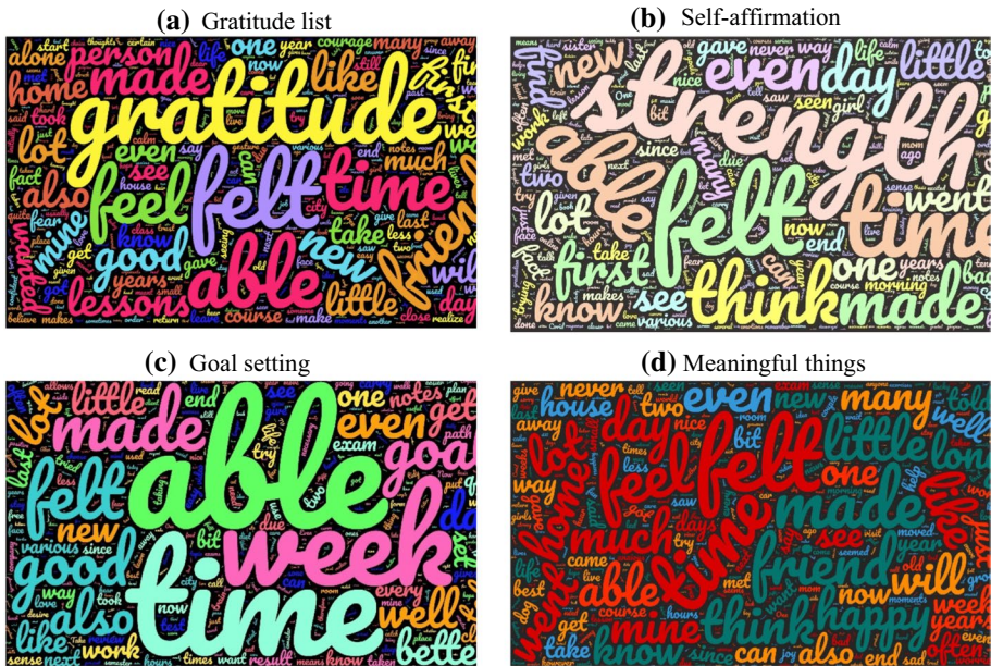
Fig. 1 Content of the episodes reported by the four groups

reported feelings and/or things done during the week. However, they differed in the kind of words reported more frequently. In fact, the group gratitude list most frequently reported the words ‘gratitude’, the group self-affirmation ‘strength’ and the goal setting ‘week’. This clearly shows that they focused on grateful episodes or on their strength or goals achieved in a timely manner (week). The meaningful things group varied a lot in the kind of words used, such as ‘home’, ‘friend’, ‘happy’, ‘like’. None of these words was as frequent as ‘gratitude’, ‘strength’ and ‘week’ in the other three groups. This confirms that the four groups engaged in the task required, as they reported episodes consistent with the instructions given.