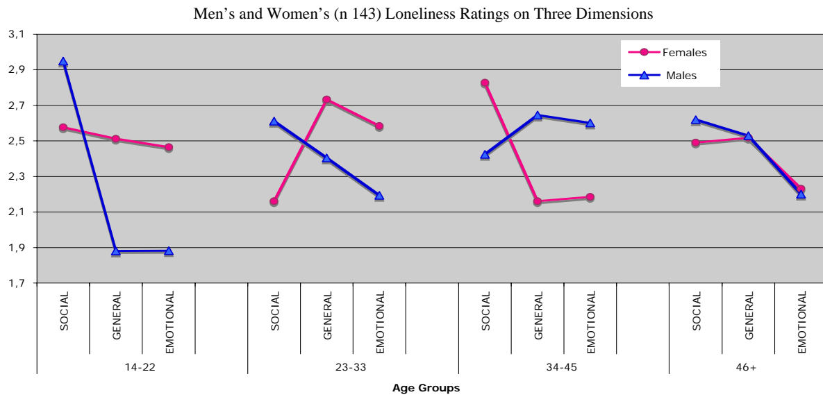
Fig. 1 Mean scores of 3 Loneliness Subscales in Italian respondents, readers of the magazine Focus (Study 2)