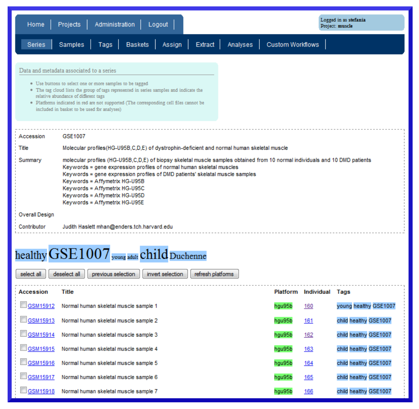
Figure 2 Screenshot of the A-MADMAN web application. The figure shows a series object, with associated data, metadata, user-defined annotation and sample assignment. A tag cloud indicates the relative frequency of tags associated to samples pertaining to the series.

male patients affected by any muscular dystrophy different from the Becker's or the Erb's ones.