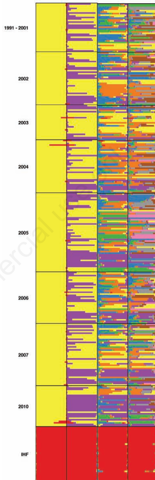
Figure 3 Estimated group assignment percentages for the whole BUR population divided in birth year groups based on a Bayesian clustering approach as implemented in STRUCTURE v.2.2.3. Values of runs with the largest \ln \Pr(G|K) for K=2 , K=3 , K=6 and K=9 , among the 50 independent runs, are shown. Each individual is represented by a single vertical line broken into K colour segments, with lengths proportional to the estimated membership to the inferred cluster.