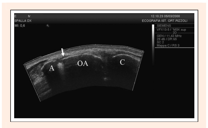
Figure 3. The US panoramic view identifies the two fragments of os acromiale (A=Acromion, OA= Os Acromiale, C=Clavicle), the "pseudo" acromioclavicular joint without synovial membrane (indicated by the white indicator) and the "real" acromioclavicular joint.

- strengthening exercises for lowering humeral head muscles with the elastic bands fixed to wall bars by slow return from 80 degrees of flexion of the shoulder and extended elbow, up to neutral position holding for 15 seconds final position, with 5 series of 15 repetitions for each session.