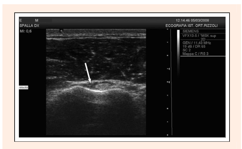
Figure 4. US transversal view shows the presence of liquid stratum around long head of humeral biceps.

- strengthening exercises for the scapular stabilizer muscles using light dumb-bells. The patient was standing with his arms at the side, elbow flexed 90 degrees, and moves his shoulders forward and backward, approaching the shoulder blades to the spine.