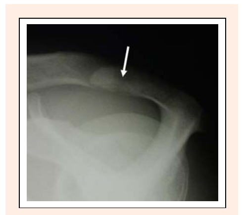
Figure 2. The outlet radiographic view of the right shoulder shows with difficulty the presence os acromiale.

Clinical and physical examination showed symmetric shoulders and absence of muscular hypotrophy or scapular dyskinesia. We found full range of motion in all directions, but associated to pain in overhead position in the right shoulder only, and absence of neurological compromise. Specific impingement tests as Neer, Hawkins, Whipple and Yocum were positive, digital compression of the OA site was painful, Jobe test for supraspinatus muscle was positive as were the palm-up test for long head of biceps, all only in the right shoulder.