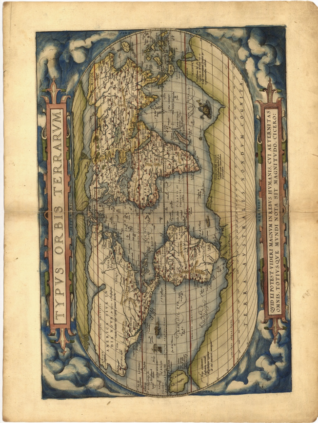
Fig. 2: Abraham Ortelius, Typus Orbis Terrarum , 1570. Engraving, 34 x 49,4 cm.