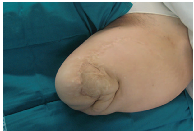
Fig. 2. The left lower limb was amputated.

Disclosure: The authors have no financial interest to declare in relation to the content of this article. The Article Processing Charge was paid for by the authors.