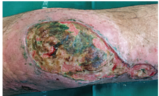
Fig. 1. Chronic nonhealing skin ulcer of the left knee. The green color of the necrotic tissue suggests an improbable correlation with common causes of skin ulcer. The perfect design of the margins of the ulcer could reveal an iatrogenic cause.