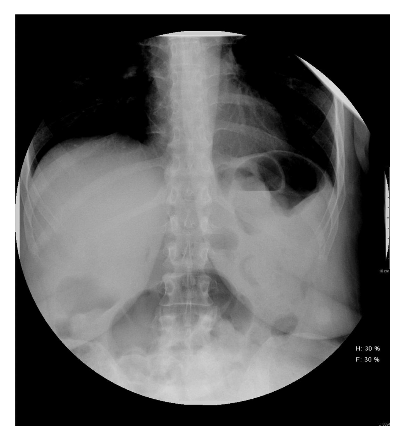
Fig. 1: W, 41 yrs. Plain x-ray of the epigastric region, which shows the presence of an air-fluid level in the left hypochondrium