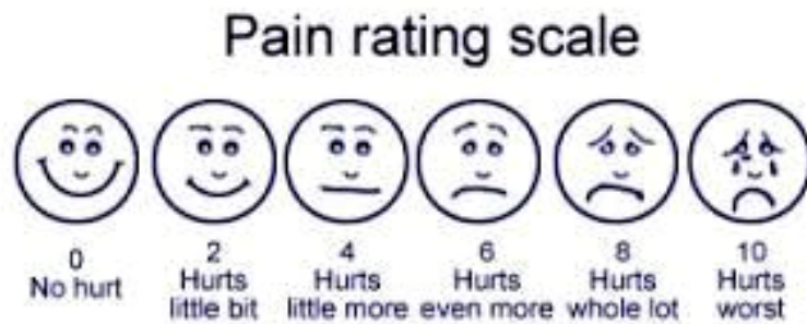
Figure 2. Example of a visual analog scale to measure pain. Participants are requested to rate their perceived pain choosing one of the six different options. No copyrighted figure.

Another example is offered by Hui et al. (2007), who investigated the effects of acupuncture stimulation in eliciting “deqi”, a composite of sensations interpreted as the flow of qi or ‘vital energy’ according to the traditional Chinese medicine. Their procedure was entirely based on IPAs and described as follows :” At the end of each tactile stimulation or acupuncture procedure, the subject was questioned by another researcher in the team if each of the deqi sensations (aching, pressure, soreness, heaviness, fullness, warmth, cooling, numbness, tingling, dull pain), sharp pain or any other