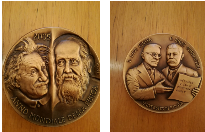
Figure 7: This medal is kept at the University of Padova's main archive at the main building of the University: Palazzo del Bo . It was designed by the sculptress Orietta Rossi on the occasion of the World Physics Year 2005 (see the brochure [2] at p. 29.).

In Padova there is still more evidence of Ricci-Curbastro's role in the history of the town. The municipality of Padova has named a street after this prominent citizen, Via Gregorio Ricci Curbastro (GPS coordinates [45.396772, 11.890183]). This street intersects another named for Levi-Civita.