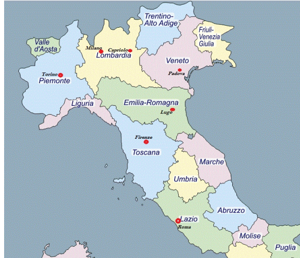
Figure 2: This map shows the cities of our story and some other important and well-known towns: Roma, Milano, Torino and Firenze.