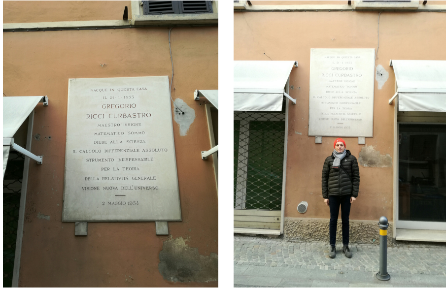
Figure 3: House where Gregorio Ricci Curbastro was born. The first author went to visit the house (he is standing below the inscription), but nowadays it belongs to new owners and is not open to the public.

“all’italiana” of the Emilia-Romagna region (see [7]). It is also worthwhile visiting Casa Rossini , the house that was owned by Rossini’s father, now converted into a museum.