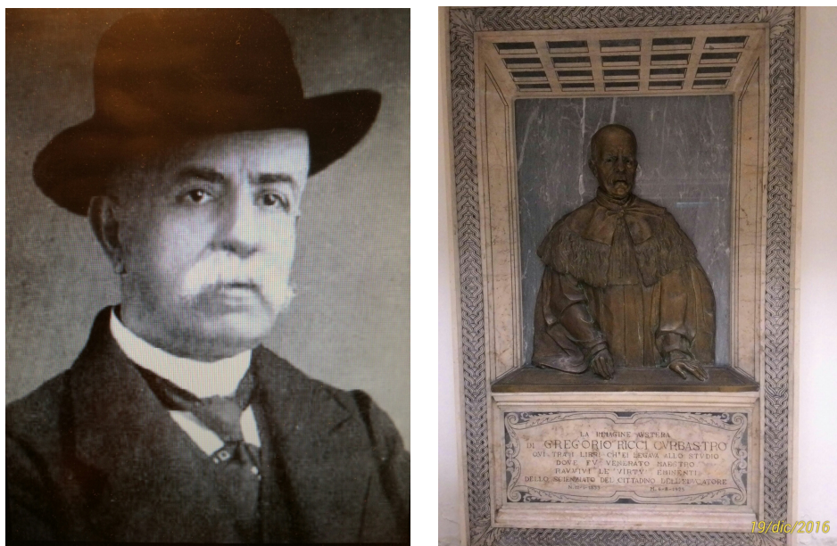
Figure 5: Left: Ricci Curbastro portrait. Right: the bas-relief in the Department of Mathematics library, it says “The austere image of Gregorio Ricci Curbastro among the books that he connected to the study, where he was a venerated teacher [...]”

(see Figure 7) that can be found in the archive of the University, located in the Palazzo del Bo . On the front side there are the two “columns of modern physics”: Einstein and Galileo. Galileo, as we already noted, was professor in Padova for 18 years, from 1592 to 1610, the year he published his famous book “ Sidereo Nuncius ”. In it he wrote “I spent 18 years in Padova, the best of my career”. Einstein as we already observed, was grateful to Ricci Curbastro and Levi-Civita for the mathematical tools they provided with the absolute differential calculus . On the back side of the medal there are the two mathematicians that made the University of Padova a center of attraction for the mathematical physics and geometry of the beginning of the twentieth century. For interested tourists, in the Palazzo del Bo , in addition to Galileo’s podium, one can see the world’s first permanent anatomical theatre, dating from the 16th century. These and other important “symbols” of the University can be visited by taking one of the daily guided tours organized by the University (they can be booked online at the University web site www.unipd.it ).