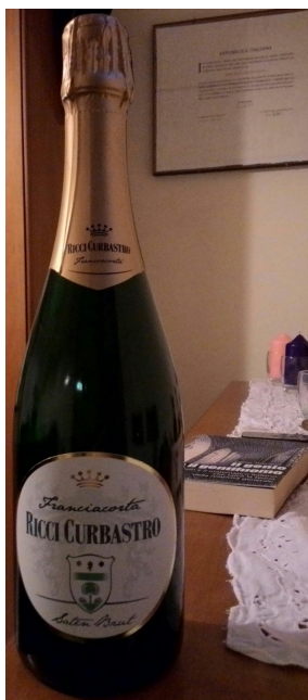
Figure 1: Ricci Curbastro Satèn brut was awarded for six consecutive years from 2001 to 2006 the “Cinque Grappoli” award by the Italian Sommelier Association (AIS) and successively by other wine societies worldwide. The Satèn Brut is the ultimate expression of the typicality and harmony of Franciacorta DOCG.

Lugo di Romagna (Ravenna), in Rontana di Brisighella (Ravenna), and the farm estate of Capriolo in Franciacorta (Brescia), where the Satèn brut is produced. The acronym DOCG, which in Italian stands for Denominazione di Origine Controllata e Garantita , represents the highest quality level in which Italian wines are classified. The classification from the lowest to the highest quality is: Vino da Tavola , VdT , Indicazione Geografica Tipica , IGT , Denominazione di Origine , DOC and finally DOCG .