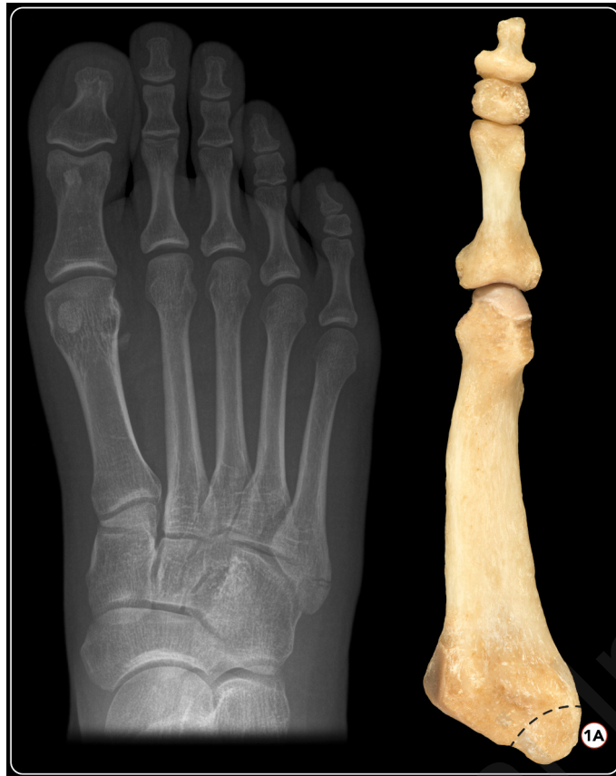
Figure 3. X-ray of a Type-1a fracture and correlation in bone model: fracture involving the lateral one-third metatarsal-cuboid joint.