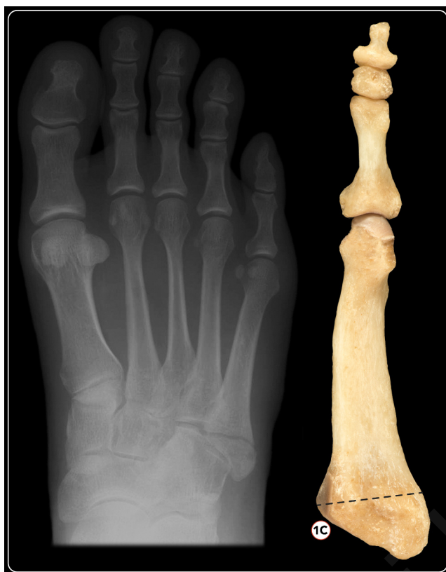
Figure 5. X-ray of a Type-1c fracture and correlation in bone model: fracture involving the medial one third metatarsal-cuboid joint.