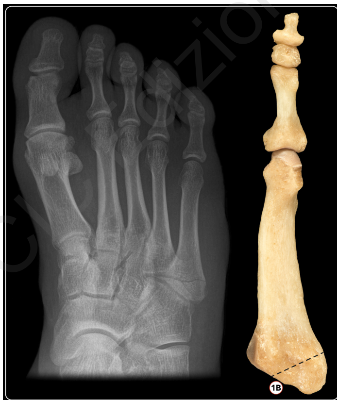
Figure 4. X-ray of a Type-1b fracture and correlation in bone model: fracture involving the middle one-third metatarsal-cuboid joint.