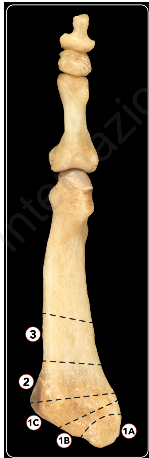
Figure 2. A 3-zone anatomical classification of 5MTB proximal part used during our analysis according to Mehlhorn, Lawrence and Botte studies. Zone-1a: including the lateral one-third metatarsal-cuboid joint; Zone-1b: including the middle one-third metatarsal-cuboid joint; Zone-1c: including the medial one third metatarsal-cuboid joint. Zone-2: including the junction between the proximal diaphysis and metaphysis of the fifth metatarsal. Zone-3: including the fifth metatarsal shaft.