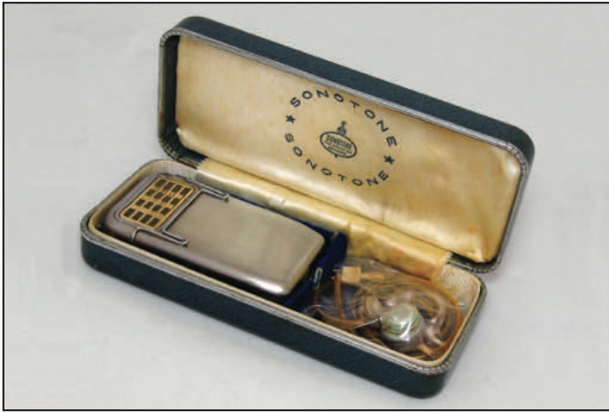
FIGURE 3 – The Sonotone Model 1010 Hybrid Hearing Aid, which consisted of two vacuum tubes and one transistor. This hearing aid was the first commercial product in the world to use a transistor. It was introduced in the United States on 29 December 1952.

resulted in a much longer battery life and, consequently, lower operational costs (Figure 3). The first fully transistorized and miniaturized hearing aids were produced in 1953, but they were initially hampered by an operating life of only a few weeks due to transistor damping.