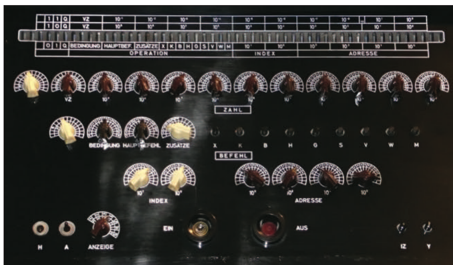
FIGURE 6 – The control panel of the Mailüfterl, completed by Heinz Zemanek in 1958. The design, started four years earlier, was an early transistorized computer.

The possibility of operating both as a two-state electronic switch, similar to a relay but much faster, and for signal modulation with very low losses and size, unlike vacuum tubes, allowed transistors to be used in an incredible number of functions, in both information and power applications. In just a few decades, they became the key components of almost all modern electronics, revolutionizing signal processing, information technologies, and power electronics. The transistor has become as ubiquitous as few other products. Every year, many billions of transistors are manufactured as discrete devices, and many more are used in integrated circuits (ICs) as part of complete electronic circuits. A processor transistor