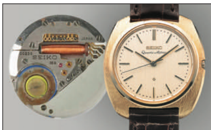
FIGURE 2 – The Seiko Astron, the first commercial quartz wristwatch. The miniaturization of a quartz clock was made possible by transistors.