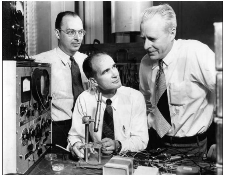
FIGURE 1 – The famous official picture released by Bell Labs of (from left) John Bardeen, William Shockley, and Walter Brattain to celebrate the invention of the transistor in 1948 conceals the grudge that had grown between Bardeen and Brattain and their group leader.