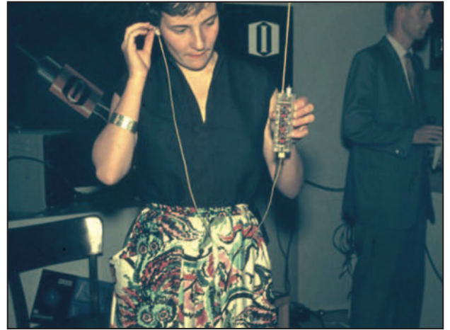
FIGURE 4 – The very first portable transistor radio, exhibited by Intermetall at the Dusseldorf Radio Exhibition in 1953.