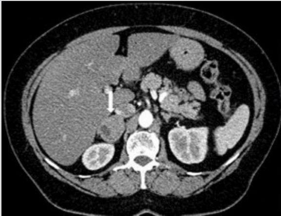
Figure 1. Computed tomography of the abdomen showing an incidental finding of a right adrenal mass (diameter 28 mm)

On physical examination, the patient's heart rate was 61 bpm and her blood pressure (BP) was 150/90 mmHg without postural drop, her BMI was 30.7 kg/m 2 , and she had a waist circumference of 107 cm. No signs of hypercortisolism, such as buffalo hump, moon face, striae or skin abnormalities, were seen. Ambulatory blood pressure monitoring (ABPM) revealed a global mean BP of 135/85 mmHg without a drop in nocturnal BP (non-dipping profile). The EKG was unremarkable. Routine blood tests were normal. Hormonal evaluation was performed after adequate preparation (Table 1). In particular, urinary free cortisol (UFC) and plasma cortisol (PC) following an overnight dexamethasone test were high and associated with a low plasma ACTH value. A diagnosis of subclinical hypercortisolism (SH) was made, and considering the increasing diameter of the adrenal mass, the patient underwent a laparoscopic adrenalectomy. Intraoperatively, the patient did not experience any haemodynamic alterations. The post-operative course was uneventful, and the patient was discharged from hospital on a cortisol substitute and attended regular follow-up appointments.