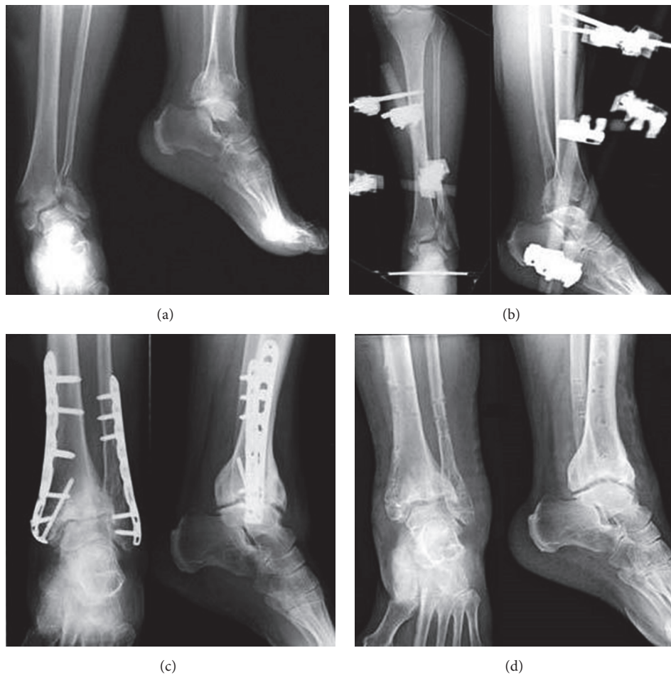
FIGURE 2: Case N° (47) of Table 2: a 68-year-old man with a 43-B3 closed fracture treated with two-stage ORIF technique : (a) preoperative radiographic image; (b) after prefix implant, radiographic image; (c) definitive implant after 16 days, 1-month follow-up; (d) radiographic aspect at 37-month follow-up after implant removal.

Dividing the cohort based on the type of treatment, the results obtained by the SF-36v2 questionnaire were higher on average in the group of patients operated by MIPO (49.02 points), slightly lower in that operated by ORIF (45.72), and