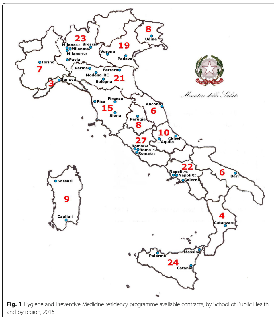
Fig. 1 Hygiene and Preventive Medicine residency programme available contracts, by School of Public Health and by region, 2016

accreditation criteria in terms of structural and organizational standards, professional development requirements, included core competencies, staff and faculty capacity needs.