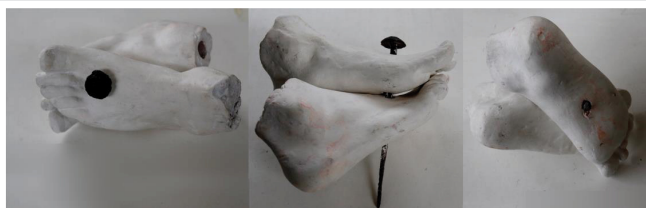
Figure 4: 3D models of feet produced to study in the details the posture of the TS Man.