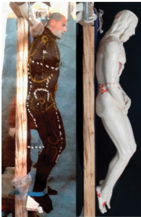
Figure 3: Experiments of crucifixion (on the left) compared with the resulting rigor mortis of the 3D model of the TS Man (on the right).

3. Head position. The iconographic tradition depicts Jesus Christ on the cross with his head bent forward, but turned to the right and this likely originated from direct testimony. This posture of the head can be explained by the consequences of the fall of Jesus, which has led to a paralysis of the posterior