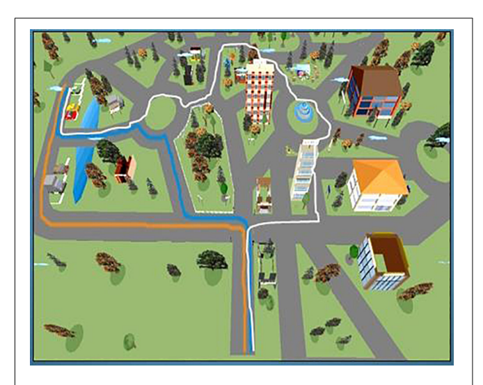
FIGURE 1 | The virtual environment with the original route learned (in white) and the two shortcuts (in blue and orange) correctly identified by 50 (43%) participants.

Table 1 shows descriptive statistics and correlations between all variables, revealing a distinct pattern of correlations between the measures of individual differences, and between these and the two WF tasks. As expected, the two WM tests, the Corsi Blocks Task and the Pathway Span Task, correlated moderately with each other, such as the Corsi Blocks Task and the MRT. Significantly, all these WM and spatial abilities measures showed specific correlations with the number of errors in the route-tracing task. On the other hand, the measures of pleasure in exploring, self-efficacy, and spatial anxiety correlated strongly with each other,