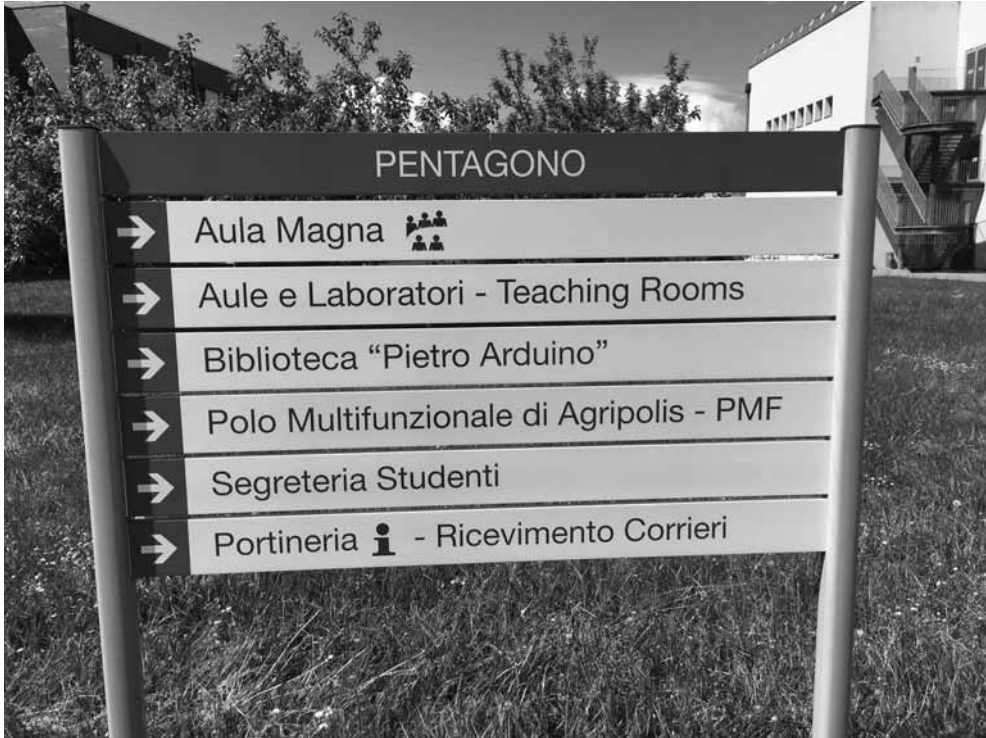
Figure 7: photograph of directions on the Agripolis campus.