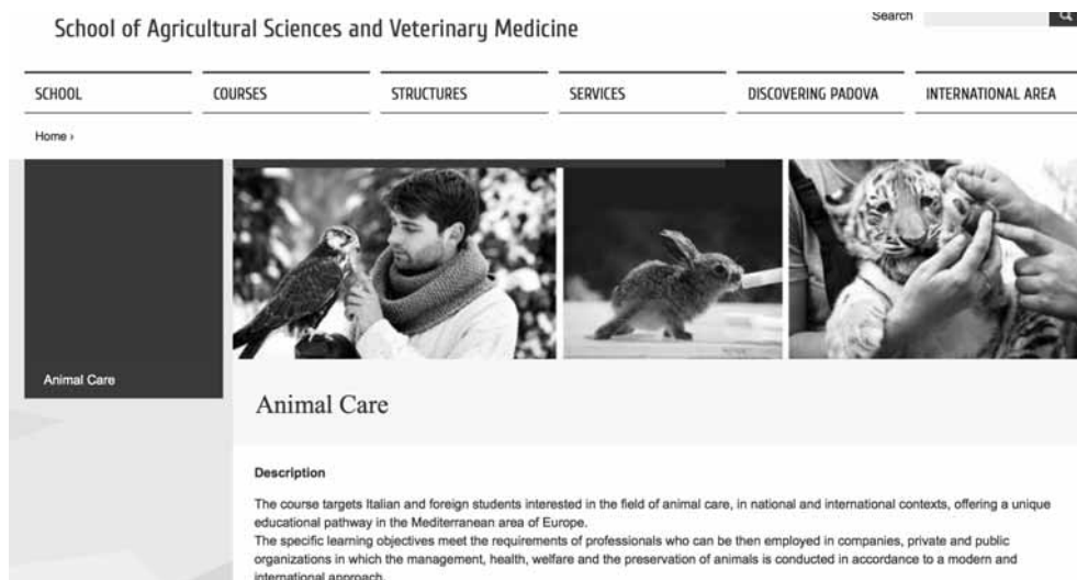
Figure 3: Homepage of the first-cycle degree course in Animal Care (screenshot date 15/3/2017)

The second entry route for international students is directly through the English language versions of the individual schools' webpages – again available by clicking on the EN button in the right-hand corner of the toolbar at the top of the page. Both schools provide introductory videos, a banner with information about international events, information about services such as accommodation, canteens, libraries, language courses, health services, student associations, linking to the English language pages of external websites, such as that of the housing association. One notable feature is the video produced by the School of Psychology, which is plurilingual with subtitles in English, and features students speaking a range of languages, from German to Farsi 55 . As well as the presence of English on the website, the linguistic background and resources of international students are used to index a globalised university environment where students from a range of linguistic backgrounds are welcome.