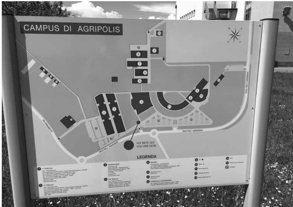
Figure 5: Map of Agripolis campus

It is interesting that 'teaching rooms' is the only English expression found on the signs giving directions. It appears on the same level and after the Italian words Aule e Laboratori which literally mean classrooms and labs. Perhaps because the literal translation would have been too long for the sign, the shorter version 'Teaching Rooms' was selected. What is