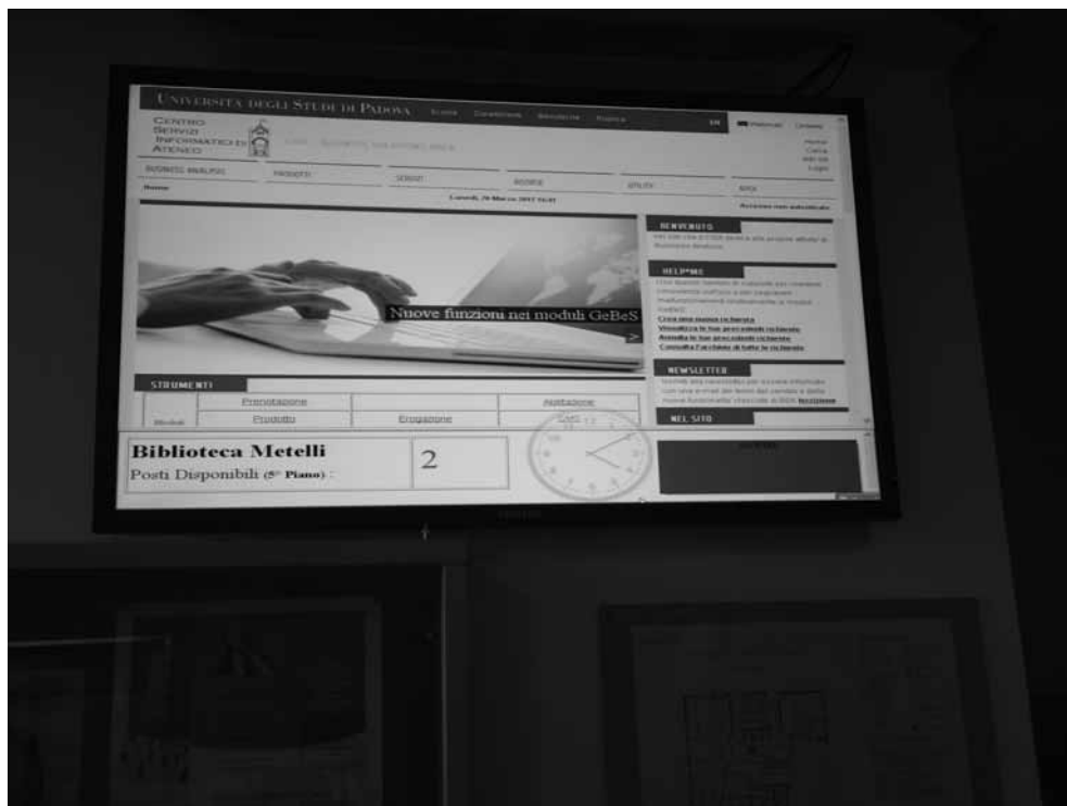
Figure 11: Electronic flat panel display in Psychology building.

The department of psychology has an electronic notice board which provides information about the timetable and alternates this with other institutional websites which provide information, as can be seen in the picture below. These have been classified as predominantly Italian as almost all of the information is provided in Italian. Some English words do appear at the level of headings: Home, Help me, Newsletter, Business Analysis but their presence is not to index information in English for the information provided below these headings is in Italian. English here has a very superficial, symbolic function, indexing globalisation and the spread of English terminology, but it is not being used to provide information or to address international students.