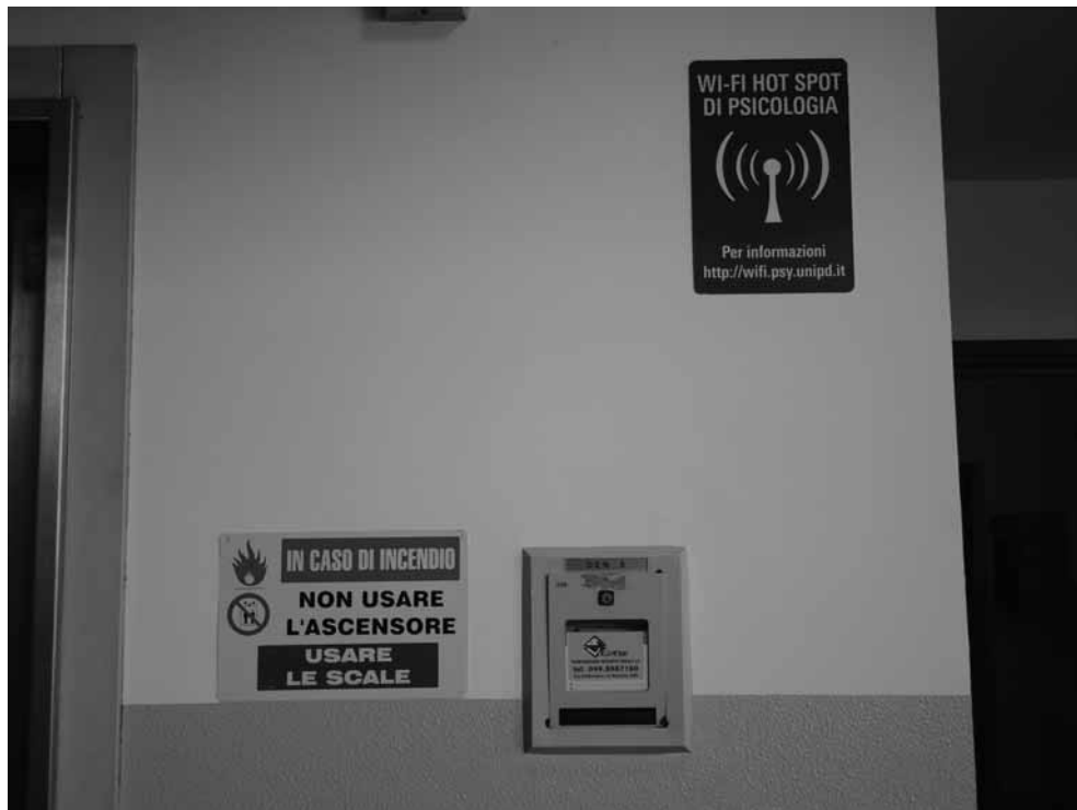
Figure 8: Safety notice about lift and Wi-fi hot spot at Psychology

There are some English words, such as “wi-fi” and “hot spot” which have come to be used in Italian more often than the Italian equivalent and tend to be used on signs, as in the sign above. However, the sign is characterised as predominantly Italian as the syntax and other words appear in Italian.