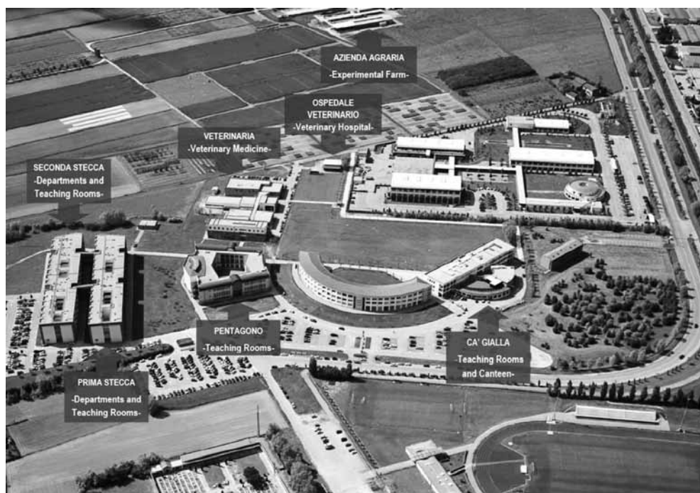
Figure 6: photograph of the Agripolis campus published on the School website.

The decisions as regards the public signage are made by the Polo Multifunzionale , a body concerned with the functioning of certain university areas. The course director that we interviewed had not been consulted about the signage, and was not able to inform us as to why “Teaching Rooms” were the only English words included on the signs.