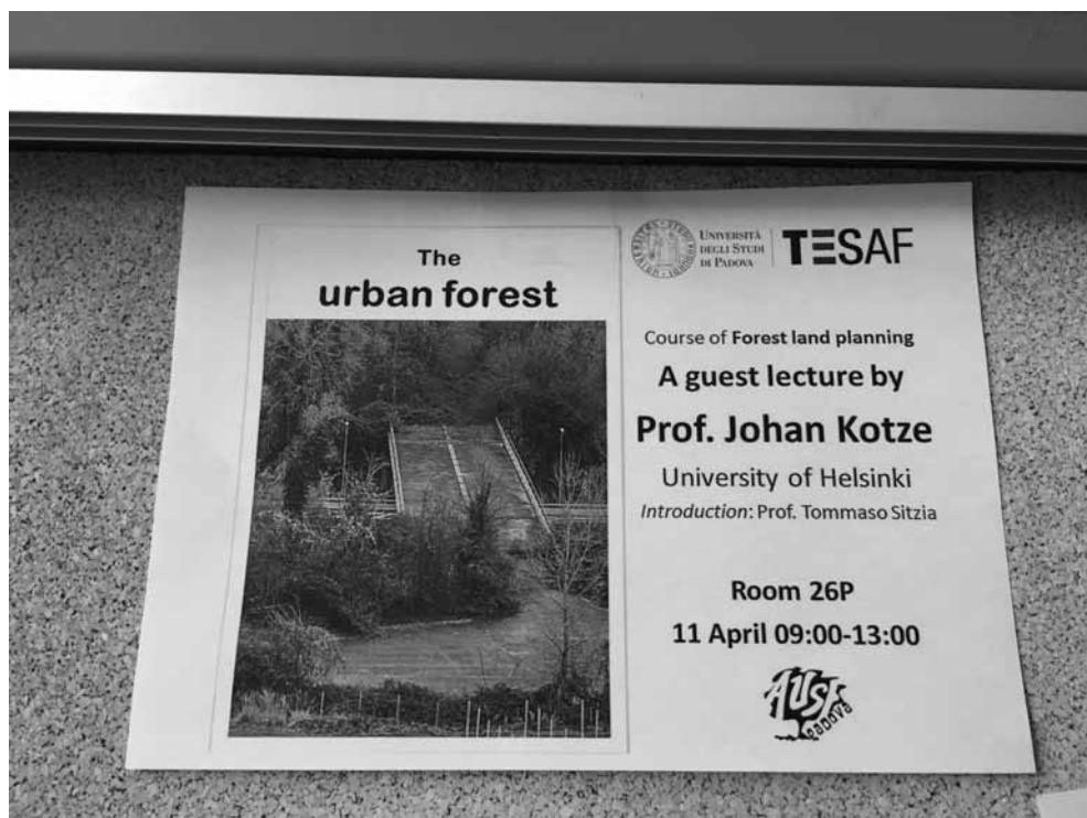
Figure 12: Publicity for a seminar at Agripolis.

The linguistic landscape of both areas observed is also characterised by temporary paper signs posted on various types of official notice boards around the interiors of the buildings and on the doors of some professors. Though the size of text on these signs is often very small, and does not have as strong a visual impact as the semi-permanent signs, we have nonetheless considered these as part of the linguistic landscape. Most of these signs have been posted by institutional staff members; several different functions were identified, such as providing information about courses, exams, thesis writing, opportunities for placements and study abroad. The vast majority of these signs were monolingual Italian only, and equivalent signs in English were not available. There were, however, several monolingual English paper signs which were those advertising courses (summer/winter schools, second cycle degrees), international conferences or guest lectures (see figure 12). These appeared on the school notice boards and on the doors of some of the professors and ETP course directors, with the symbolic function of indexing internationalisation.