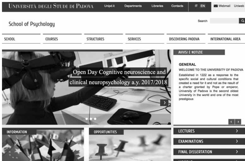
Figure 4: Homepage of the School of Psychology (screenshot date 15/3/2017)

It is worth highlighting that the content available on both the Schools' English language webpages is different from that available on the Italian pages as it is customised for international students intending to enrol or already enrolled in these ETPs. Less content is available and links tend to lead to less dynamic content (for example pdf files). The use of languages on the site could thus be said to exhibit "limited parallel monolingualism" (Heller 1999), indexing a "two solitudes" 56 model of bilingual education whereby languages live alongside one another but do not appear to interact.