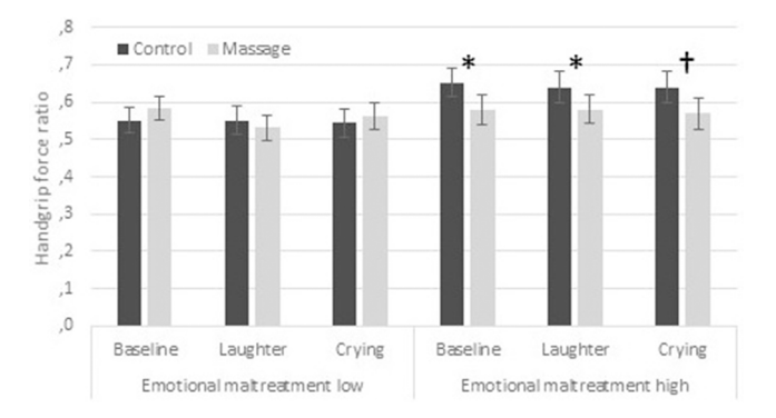
Fig. 3. Mean (SE) handgrip force ratio at baseline and during infant laughter and crying in the control and massage condition for individuals with low and high emotional mal-treatment (Study 2: male sample).