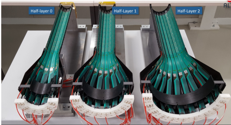
Fig. 1. Photograph of the upgraded ITS inner half-layers