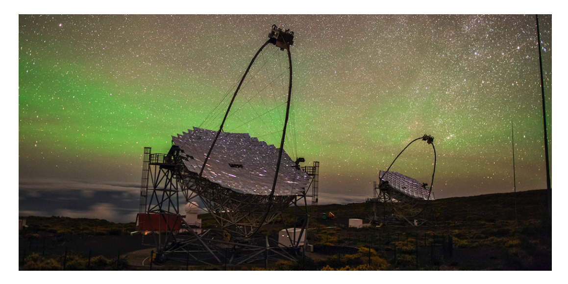
Figure 1: The MAGIC stereo system composed of two 17 m diameter dishes operating simultaneously. Telescopes are located in the Roque de los Muchachos Observatory in the Northern Hemisphere (28.7°N, 17.9°W).

The Major Atmospheric Gamma-ray Imaging Cherenkov (MAGIC) telescopes are a pair of 17 m-diameter telescopes operating in stereo mode and sensitive to cosmic gamma rays with energies between 0.5 \div 50 TeV [1] (see Fig. 1). The first MAGIC telescope operated in standalone mode from 2003 to 2009, when the construction of a second telescope marked the beginning of stereoscopic observations. The imaging technique is based on the detection of Cherenkov light from the charged component of the extended atmospheric showers of particles generated in the high atmosphere (10 - 20 km a.s.l.) by cosmic gamma rays impinging the Earth (as well as any charged cosmic ray). The Cherenkov light propagates as a narrow (few ns wide) front of photons travelling towards the ground that generate an ellipsoidal image on the MAGIC cameras, as shown in Fig. 2.