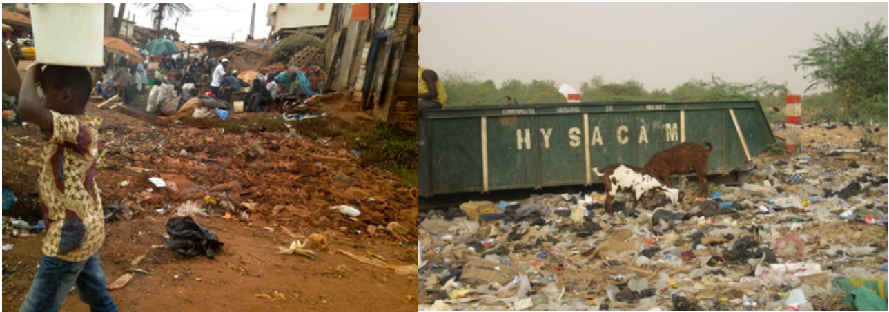
Figure 1. Waste in Yaoundé: a) in a poor neighborhood; b) along a main road in town

Yaoundé counts more than 4.000.000 inhabitants with a rate of population growth in the range of 7-10%. Nearly 80% of the urban population lives in informal settlements occupying 72% of the urban space. 46% of the population has no access to improved water sources and uses latrines as wastewater devices, mainly located close to water wells (UN-Habitat, 2015). The weekly production of municipal waste in the town has been calculated in about 1200 t.