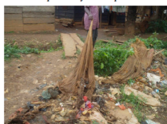
Vieilles Moustiquaires Imprégnées à Langue Duree d'Action abandonnées dans la nature