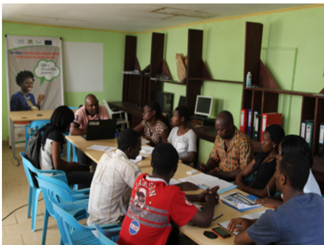
Figure 4. Event organised in the literary cafe and typical final report used as follow up document