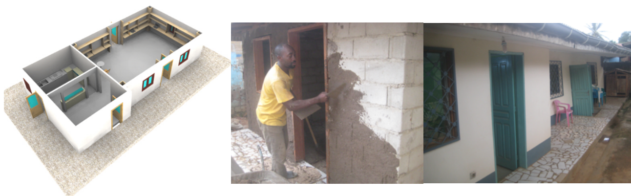
Figure 3. Different phases of the literary cafe: the project (courtesy of arch. Rosalba Giani), the restoration works, the realisation

The project was then finalized, obtaining the necessary authorizations, assessing the restoration works and selecting the furniture in such a way that the space created can provide different types of services: bar, restaurant and catering, services that can attract and welcome diversified people and that, after an initial start-up phase, facilitate economic autonomy; consultation of brochures, books and magazines at different levels of in-depth analysis of environmental issues; use of computers equipped with an internet connection in order to carry out research in the relevant sector, consult online journals, join and keep in touch with thematic networks; organization of small events like public meetings to inform, seminars and discussion groups, projections of documentaries and other material relating to environmental issues, laboratory activities of sensitization.