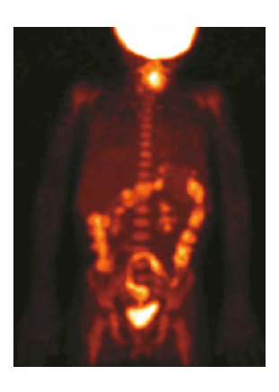
Figure 1 Maximum intensity projection image of an positron emission tomography with <sup>18</sup>F-Fluorodehoxiglucose examination shows diffuse and intense radiopharmaceutical uptake in the large bowel.

SPECT: Single photon emission tomography.