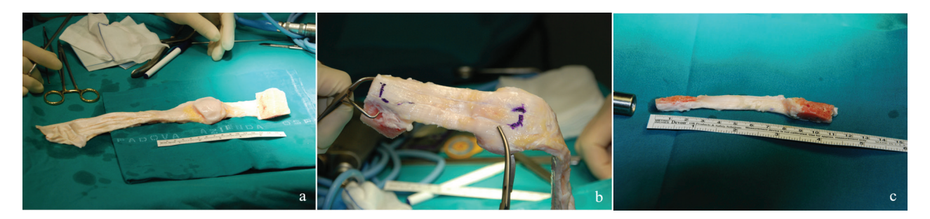
Figure 2. Three stages of allograft tendon preparation. a) BPTP at the initial stage, after thawing and preconditioning on the graft master; b) the part of BPTP choose for ACL substitution is measured and the bone part is shaped with an oscillating saw; c) allograft ready for implantation

thawed in sterile physiologic solution at room temperature before preparation and then preconditioned using the graftmaster board at 20 lb of tension for 20 minutes (Figure 2). The autografts were prepared following the same protocol used for allografts. The autologous gracilis and semitendinosus tendons were harvested through an oblique 3 cm incision over the pes anserinus (Figure 3) using a tendon stripper (Arthrex, Naples, FL) with the patient positioned on the operat-