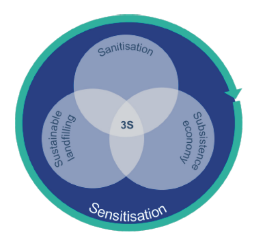
Figure 3. Graphical scheme of the 3S model proposed as a strategic tool to address the actual requirements of waste management in areas with economic constraints (Lavagnolo and Grossule 2018)

The 3S strategy (Sanitisation, Subsistence economy, and Sustainable landfilling) may represent a more appropriate solution (Lavagnolo and Grossule 2018). The 3S approach is conceived as an integrated concept, which highlights the need to combine three inseparable requirements: the improvement of the standards of living by assuring safe collection and management of the waste (Sanitation); the use of appropriate technologies, designed to provide new business opportunities (Subsistence economy); the safe disposal of residues (Sustainable landfill).