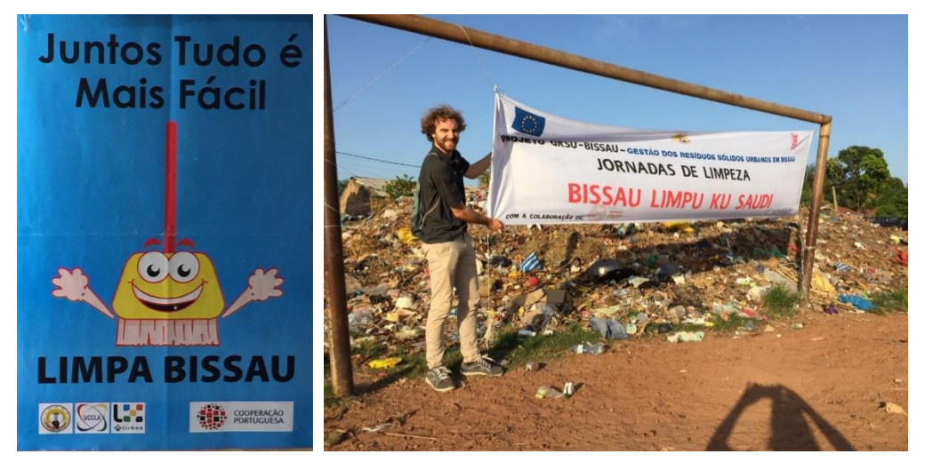
Figure 4. Educational campaign to promote waste collection in the neighbourhoods of Bissau (2015-16).

The distinctive feature of this project is that all the different steps put into action were discussed, shared, and implemented by the different stakeholders. The intervention, financed by the EU and the Guinea Bissau Government, was designed considering the local needs in terms of environmental and health protection (sanitisation), economic and social empowerment (subsidence economy), safe treatment/disposal of waste (sustainable landfill), education of the local administrators and the citizens (sensitisation). An educational campaign for cleaning the streets (waste collection) was organised in different neighbourhoods, with the aims to raise citizens' awareness and to collect data on waste quality and quantity (figure 4); a survey was planned to collect information about the Antula scavengers and the market of valuable materials, for a future safe involvement in the MSW management plan and their social inclusion; technical surveys for the siting of the new sustainable landfill were developed with the Guinea Bissau Interministerial Commission, the local authorities and the citizens and a specific Multi Criteria Analysis was designed on purpose.