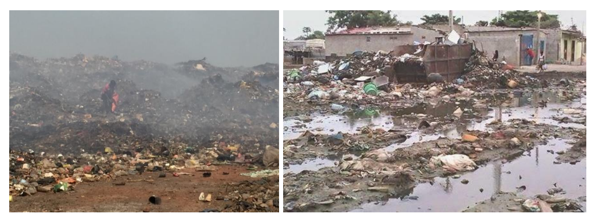
Figures 1a and 1b. Impacts of inappropriate waste management in Bissau and Yaoundé (2015).

Despite this, most of the policies adopted so fare are just on paper and no significant improvement on solid waste management has been observed (UNEP 2018): open dumps, waste accumulation on the roads, and open burning are widespread practices for getting rid of garbage. The consequences are huge environmental and health impacts related to waste littering, insufficient quantity and quality of drinking water, rapidly worsening air quality, degradation of the urban environment, impurity of the streets, river pollution and, in general, climate change. Particularly, at uncontrolled dumpsites there is a potential of health hazard to scavengers (usually children), for the spread of infectious diseases, for the highly toxic smoke, and for the odours emanating from decomposing waste (figures 1a and 1b). Impacts on the environment due to air, water, and soil pollutions and associated health risks ultimately concern the economy, too.