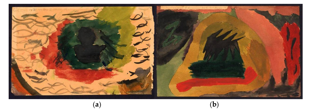
Figure 3 . (a) Marianna Löblová (born on 22 December 1933—deported from Prague to Terezín on 22 December 1942—liberated in Terezín), Watercolor on the theme of 'Fear' or 'Storm' , completed in Terezín on 20 June 1944, JMP #129.270r; (b) Edita Fischelová, (born on 15 August 1931—deported from Prague to Terezín on 24 October 1942—liberated in Terezín), Watercolor on the theme of 'Fear' or 'Storm' , completed in Terezín on 20 June 1944, JMP #129.284.