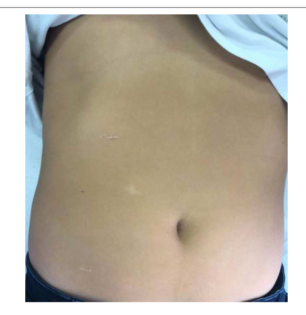
FIGURE 2 | Scar appearance after laparoscopic pyeloplasty.

The second and perhaps the most relevant issue in this age group is the concern about the potential neurotoxicity of the drugs for the general anesthesia in early childhood (38, 39). For this reason, many authors and scientific societies recommend in this age group, if surgery cannot be postponed, at least