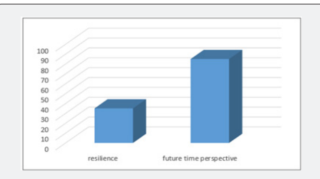
Figure 1: Levels of Resilience and Future Time Perspective that Chiara ascribed herself (t scores).