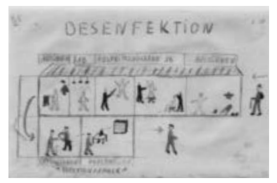
Figure 2. Disinfection and tattooing of deportees