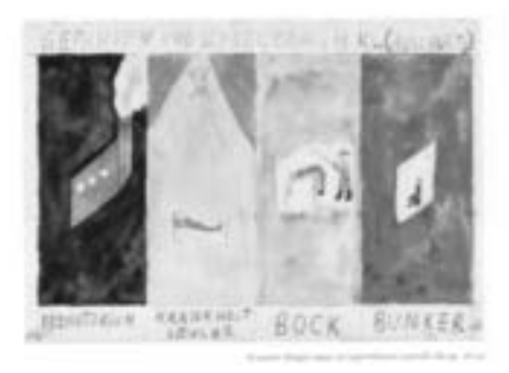
Figure 4. The dangers. Left to right in the drawing: crematorium, epidemics, beating, bunker

What strikes the viewer is the clarity and inner strength of this adolescent, who faithfully reproduces the unimaginable, managing to reprocess in such a short time the trauma he has experienced: in his maps, such as the one of the Birkenau camp in the third figure, one can make out the future civil engineer, but all of the images reveal that strength of character which enabled him, on joining his father in London in 1946, not only to start living again, but also to recoup the four years of school he had missed and to pass his final exams only a year later.