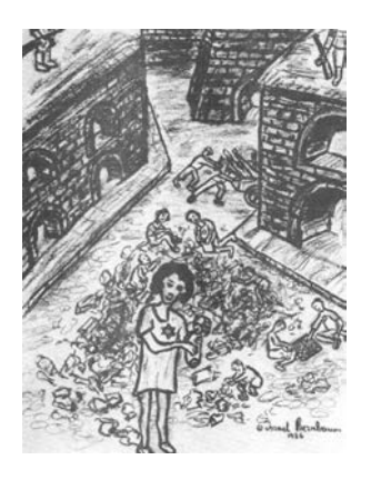
Fig. 5. Games

The evocative power of poetry and images can be presented to young people precisely as an exercise in cura sui . Inge Auerbacher provides an example of this: deported to Terezin at the age of seven, she experienced extreme situations in the transit camp and related them in her poems, which she later went on to illustrate in 1986. One of these is Games: