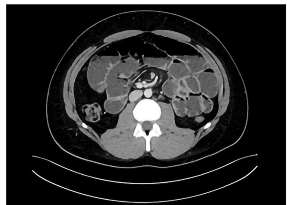
Fig. 2 CT scan with intravenous contrast showing small bowel distension with air-fluid levels, and a reduced distal ileum diameter in the right iliac fossa

A nasogastric tube was inserted and the patient received nil per os with intravenous supportive therapy. Twenty-four hours after admission, his abdominal pain had improved, and clinical examination showed a pain-free, less distended abdomen. Meanwhile, his neurological signs had worsened, with xerostomia, ptosis, mydriasis and diplopia. (Fig. 3a and b) We therefore had