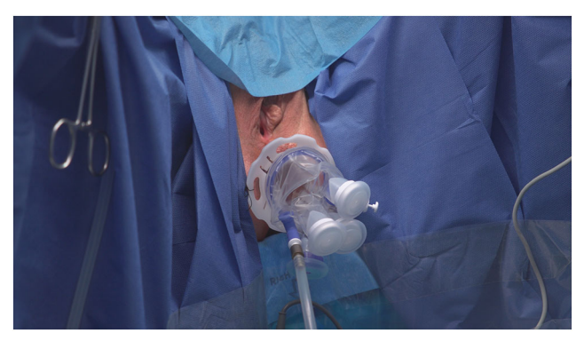
Fig. 3 The instrument positioned with fixing ring fixed by stitches to the perianal skin

Data analysis showed that the SILS Port provided superior maneuverability for sutures at 8 cm from the anal verge with respect to the GelPOINT Path and ARAMIS (p < 0.05); there