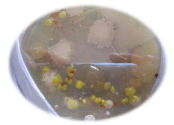
Fig. 2: Microbial load present in a plate grown by the students in which there are grown recognizable colonies of Staphylococcus aureus (golden colonies), Serratia marcescens (red colonies) and various types of moulds.

As easily predicted, in the Petri dish sawn with dirty hands, not only bacteria did grow, but also other types of microorganisms. In fact, in addition to bacteria such as Staphyloccus aureus , easily recognizable by the golden colour of its colonies, and some colonies of Serratia marcescens , bright red in colour, many moulds were recognizable, of various types and colour (Fig.2).