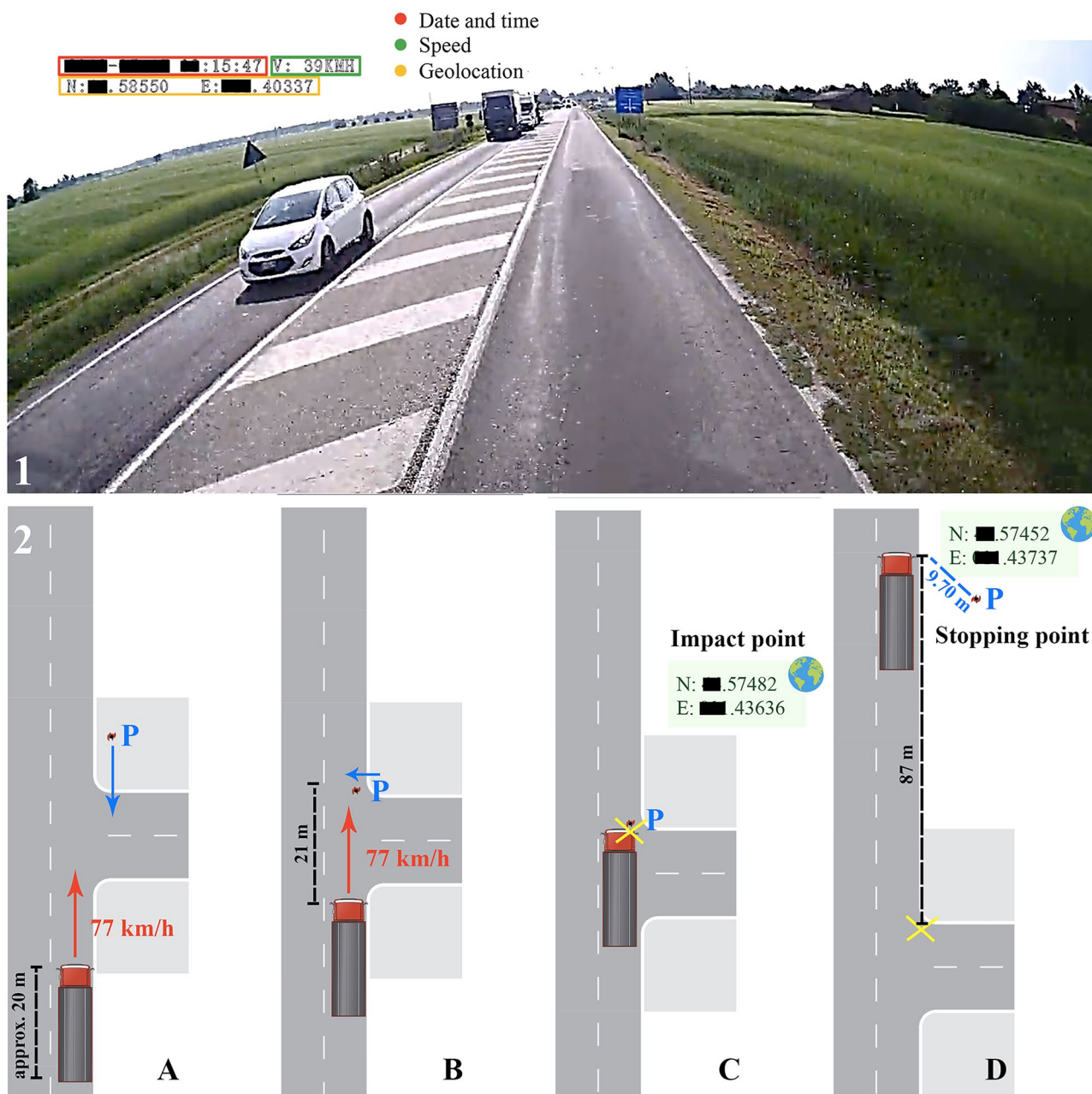
Fig. 3 1: A frame of the video recorded by the Dash Cam. 2 (A-D): Reconstruction of the dynamics. E: east; N: north; P: pedestrian