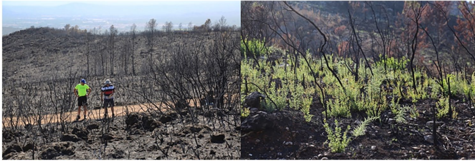
Figure 5. Wildland fires induce a sudden removal of the plant cover, but soon plant cover recovers and changes in plant composition as a consequence of the fire takes place. Carcaixent, Eastern Iberian Peninsula. To the left June 22, 2016, to the right September 8, 2016.

having larger, more intense, and severe wildland fires (San-Miguel-Ayanz, Moreno, & Camia, 2013; Figure 5).