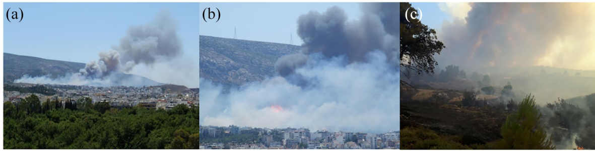
Figure 1. (a) A peri-urban fire on Mt Hymettus, in the outskirts of Athens, on July 17, 2015, with one fatality, (b) a peri-urban fire on Mt Hymettus, in the outskirts of Athens, on July 17, 2015 (detail), and (c) fire in the rural area of Kalamos Attica Greece (summer 2017).

area burned since 1991 was around 447 ha but only 283 ha between 2009 and 2018. Nevertheless, 2018 had the second highest forest area burned since 1991. The average area burned per fire generally around 0.5 ha. The current regional hotspot of wildland fires is in the region of Brandenburg with more than half of the area burned during the largest fires in 2018 (725 ha burnt only in August) and almost three times more than in the dry summer of 2003 when approximately 600 ha of forest has burnt in this federal state. This region is very prone to wildland fires as it has large proportion of connected forest area (44% of the forest is under protection, LFU Brandenburg), which are formed by pine monocultures on sandy soils, a particularly dry and flammable forest type. Since the industrialization, changes in forest management in several regions of former Prussia have replaced some of the previous and less-flammable forest dominated by deciduous trees (Dietze et al., 2019) by pine monocultures. This deep transformation was only possible by strong intervention into the hydrology, for example, building drainage ditches, which now are increasing drought problems, and thus fire susceptibility, in the mid mountain ranges.