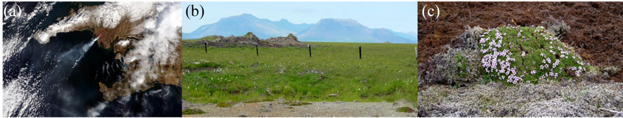
Figure 2. (a) The Myrar wildland fire on 30 March 2006 at 12:55 (image from NASA/MODIS), (b) Myrar 24 July 2006, and (c) edge of a moss fire in June 2007 (Photos: Throstur Thorsteinsson).

lowland coniferous plantations, fire damage can be significant (Szatmári et al., 2016). Human-induced fire, which is generally ignited unintentionally, is the major cause of wildland fires. Arson, for example, affects approximately 10 000 ha of grassland per year (Deak et al., 2014). Prescribed burning is scarcely applied due to legislative constraints, even though in grasslands it may present a feasible solution for several conservation challenges, for example, for increasing landscape-scale diversity, creating habitats for specialist species or for decreasing the amount of accumulated litter (Deak et al., 2014) and also for the protection of the endangered great bustard (Végvári et al., 2016).