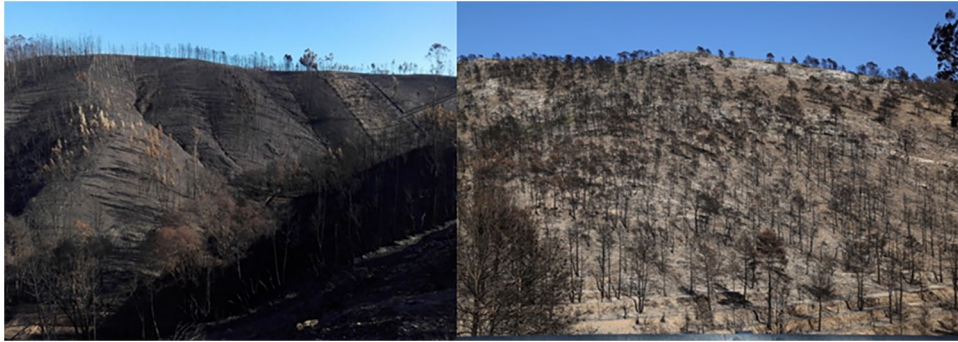
Figure 4. To the left, the recently area burned near S. Pedro de Alva village following the 15 October 2017's wildland fires in Portugal. To the right, view of the wildland fire, July 15, 2018. The Iberian Peninsula shows a long history of wildland fire, which in the last 60 years resulted in recurrent wildland fire in the north of Portugal and the Galicia region (NW) region of Spain.

conditions (Glasa et al., 2010). However, the most important changes in wildland fire prevention were adopted after the wind disaster disturbance in Southern part of the High and Low Tatras in November 2004 where about 120 km 2 of forest were destroyed. New requirements for landowners and land users were introduced for mapping the spatial distribution of water bodies, road network, and warehouses with tools for fire-fighting and building fire prevention measures. Research on the impact of fire on soil hydraulic properties (Novák et al., 2009), the effect of vegetation on hydro physical properties of soils, evaluation of fire weather indices, forest vegetation and duff moisture content indices, and wildland fire risk assessment (Šurda et al., 2015), and impact of wildland fire on the formation of bio indicative forest beetle communities (Šustek et al., 2017) was conducted as well. The applied measures include not only technical and technological modernization of fire suppression means but also substantial improvement of preparedness of firefighters and rescue workers, regional, national, and cross-border training and cooperation as well as the development of methodologies for wildland fire risk assessment, design of progressive fire protection measures, implementation of early stage warning systems based on the CCTV smoke detection (ForestWatch, later also FireWatch) and others (Majlingova et al., 2018).